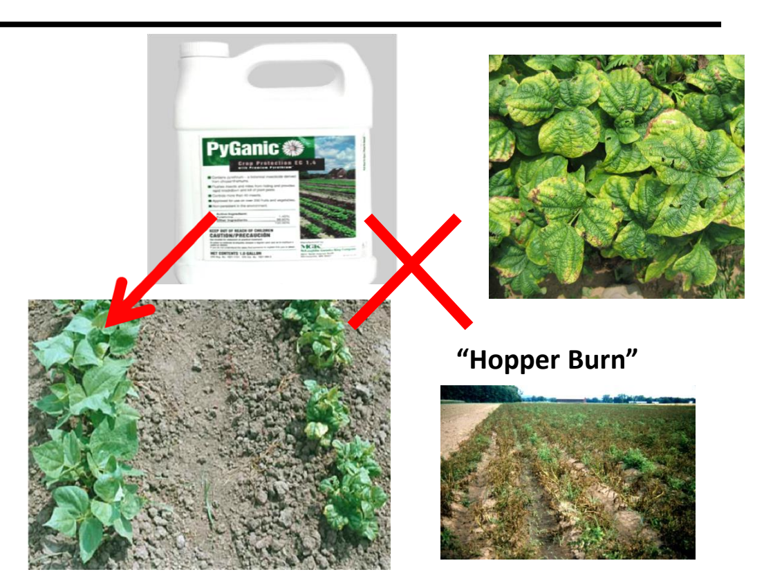
Treat if: 1 adult per row foot OR 1 nymph per leaf