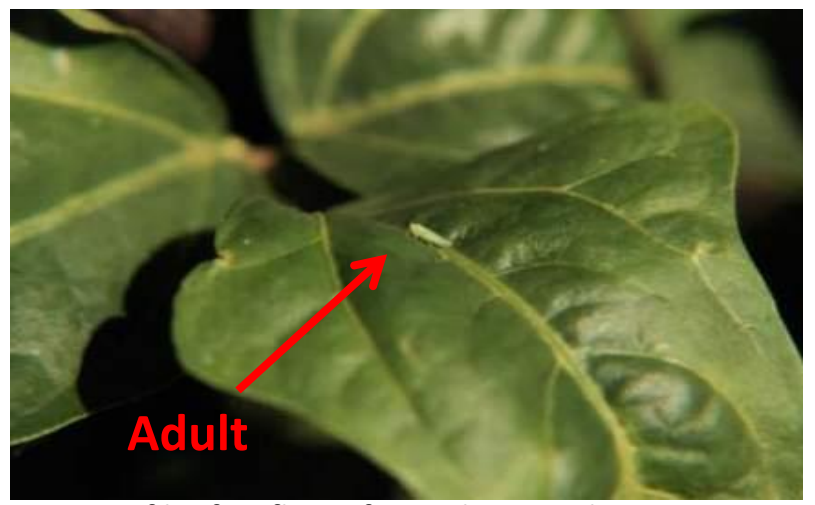
On top of leaf or flying from plant to plant.