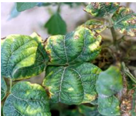
Hopper burn in beans

In green beans, thresholds are 0.5 per sweep or 2/ft of row at the seedling stage, and 1/sweep or 5/ft of row from 3rd trifoliate leaf to bud stage. Use a threshold of 1.5 leafhopper per leaf in eggplant.