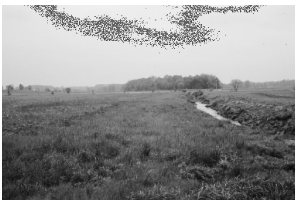
Vegetated filter strip, Gibson Co., Indiana

Filter strips are a "best management practice" (BMP) near field boundaries or within fields near water sources or inlets. They are often used along with practices such as conservation tillage, pest scouting, crop rotations, strip cropping, soil testing, contour tillage, riparian zones, and proper nutrient and pest management to improve water quality. Many state and federal agencies recommend filter strips as an agricultural and urban best management practice because of their potential environmental benefits.