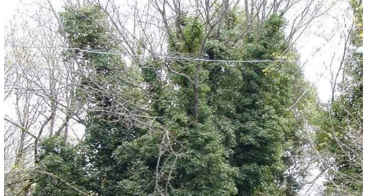
English ivy taking over a tree, increasing vulnerability to wind blowdown.

sure you monitor for weeds that take root in the initial months and years after harvest. Often you can't identify them until they grow a bit, and management depends on correct identification. Get started identifying common Northwest weeds on the next pages. Some plants like thistle emerge obviously