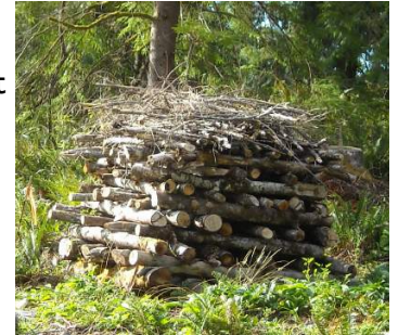
A habitat pile in Olympia, WA.

Also, be sure to identify areas where you may want slash to be dispersed or moved to create wildlife habitat piles. Pile location affects their success: in areas with little rain and hot summers, wildlife will benefit from habitat piles in shade; in cooler areas, a habitat pile on the edge of a clearing or anywhere with partial sun is best. Avoid installing habitat piles near roads, in areas that collect cool air or receive excess water, or in locations where the pile will increase fire risk.