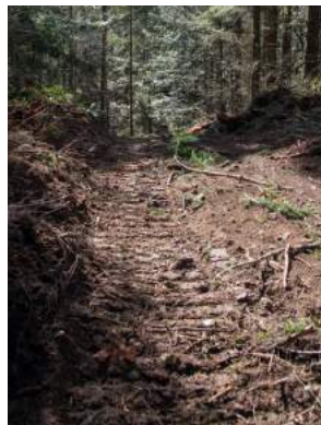
Tracked equipment has less soil impact than vehicles with tires.

Concentrating slash on skid trails and wet pockets can reduce soil impacts from heavy equipment.