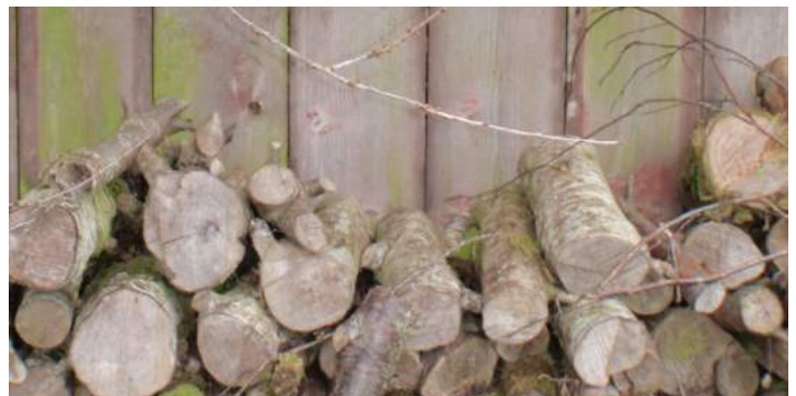
Firewood piled in Montesano, WA.