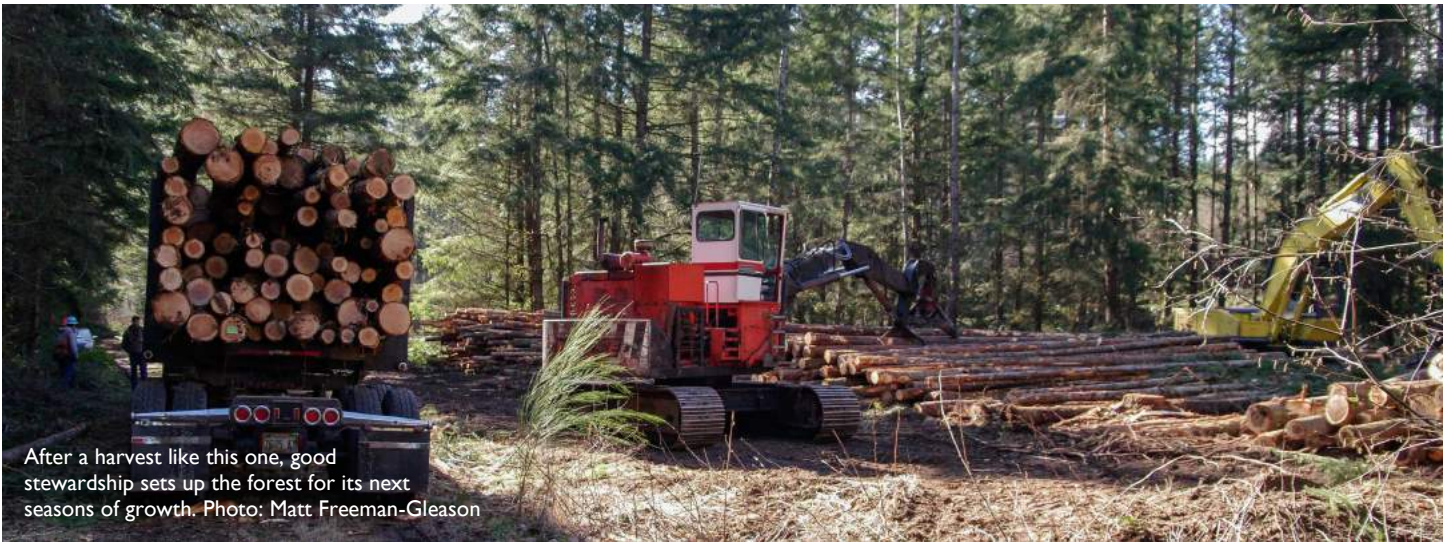
After a harvest like this one, good stewardship sets up the forest for its next seasons of growth.