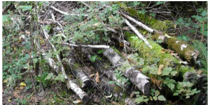
A constructed log in Olympia, WA.