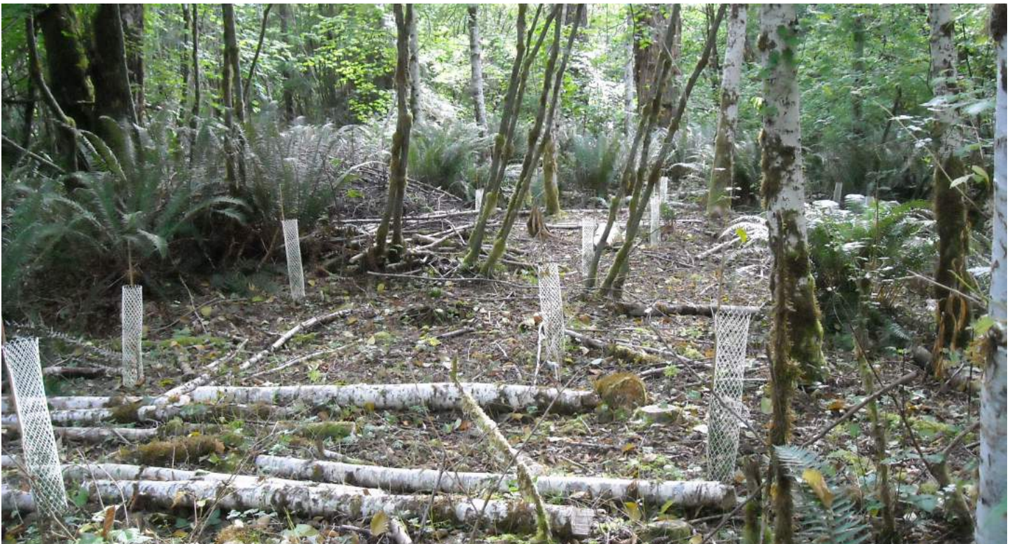
Seedlings planted in an FSC®-certified forest in Olympia, WA.

Frequently check on any browse protection and/or deterrent you apply. Cages require annual monitoring to make sure they are still functioning: they need to be lifted to continue protecting the tip of the tree, and seedlings may need to be straightened in their cages. If you use a repellent, it may need to be reapplied once or twice a year, depending on seedling survival, height growth, and browsing.