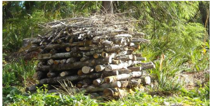
A habitat pile in Olympia, WA.