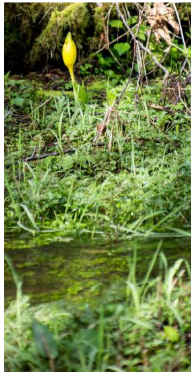
Snags, sensitive plants like trillium, and wetlands are all examples of important biological hotspots to protect during a harvest.