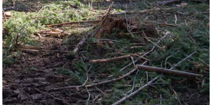
Slash distributed after harvest in Black Diamond, WA.