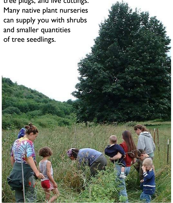
Planting with the whole family in Oakville, WA.

Common products include bare root seedlings, tree plugs, and live cuttings. Many native plant nurseries can supply you with shrubs and smaller quantities of tree seedlings.