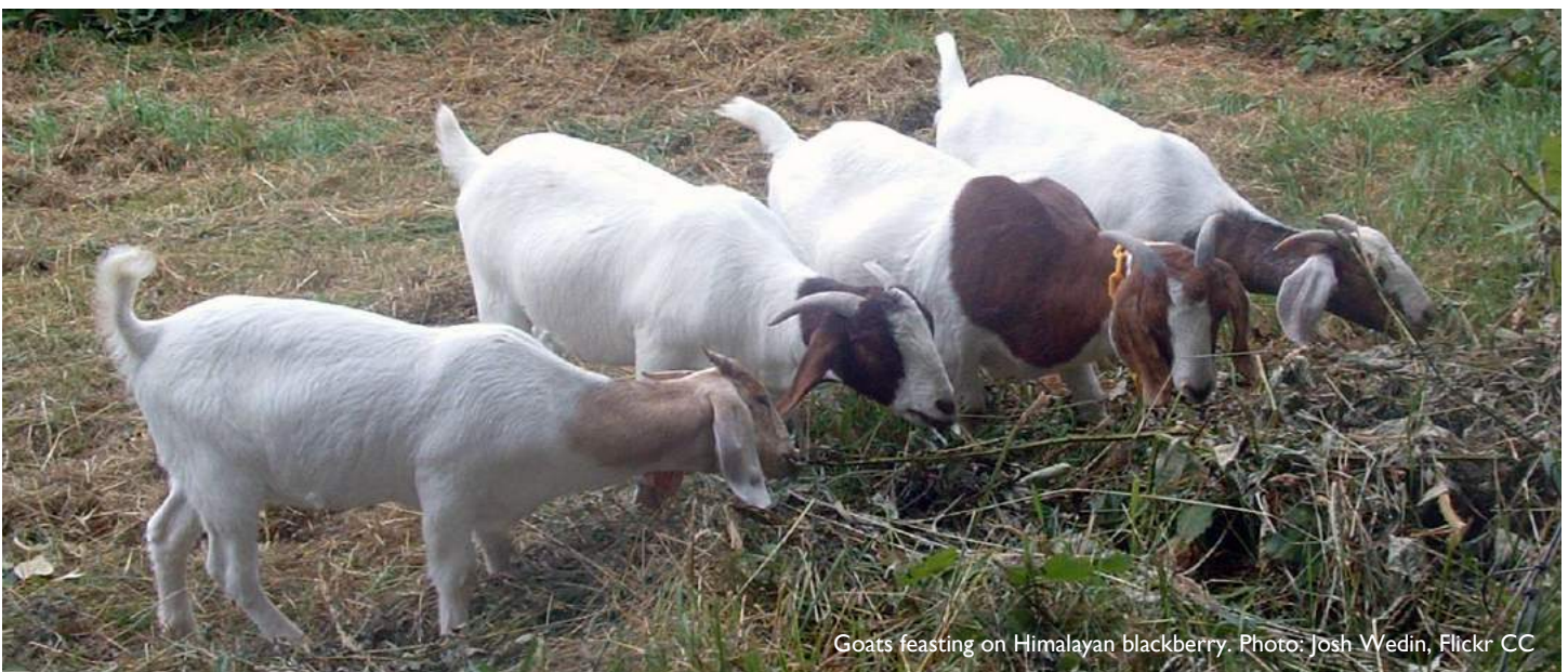
Goats feasting on Himalayan blackberry.

Remember shading out invasives with trees and shrubs is an effective long-term strategy, and planting natives will give your forest a biodiversity boost.