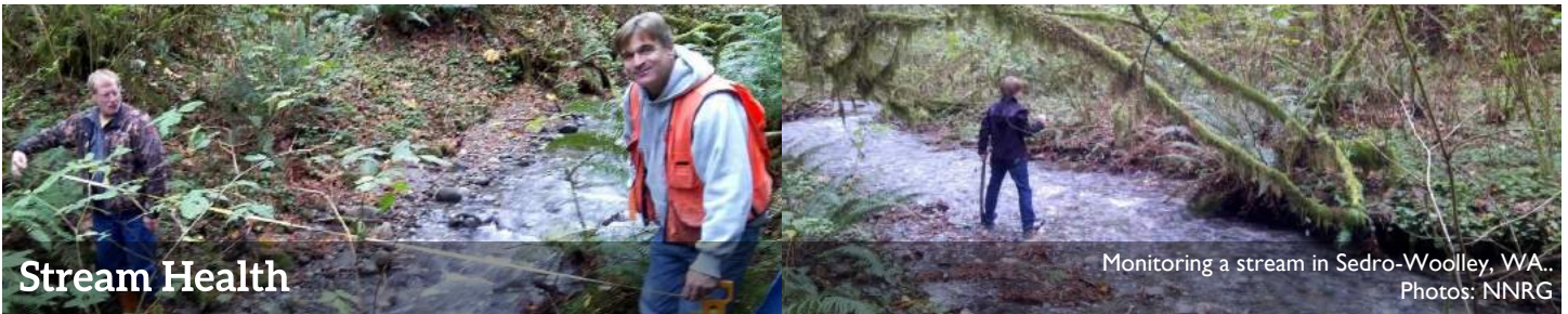
Monitoring a stream in Sedro-Woolley, WA..