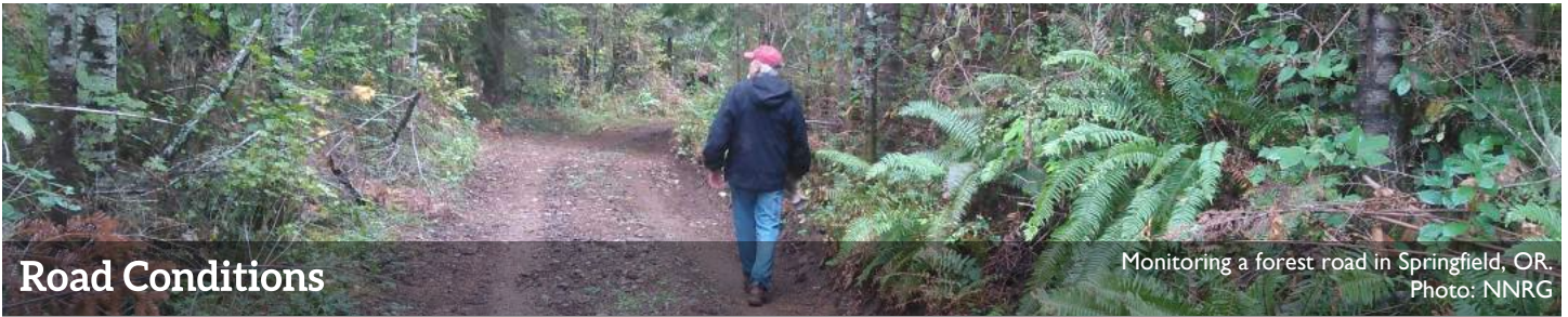
Monitoring a forest road in Springfield, OR.

Keep an eye out for these important features: