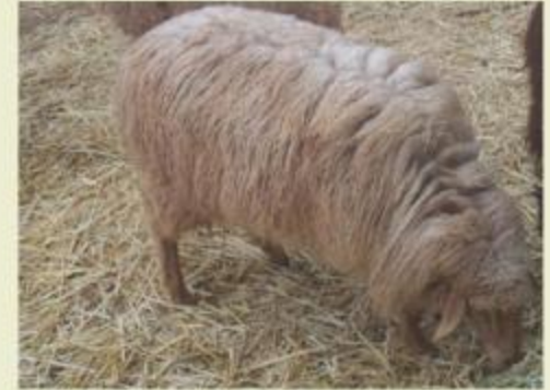
Karakul (carpet wool)