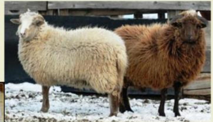
Navajo Churro (carpet wool)