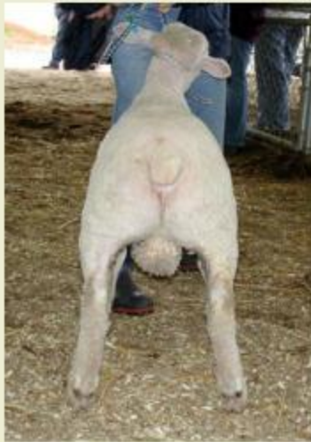
Properly docked tail