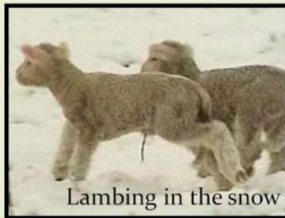
Lambing in the snow