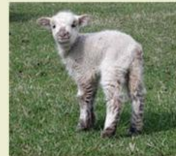
Sheep with long tail