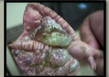
Bumblefoot in ducks (bacterial infection)